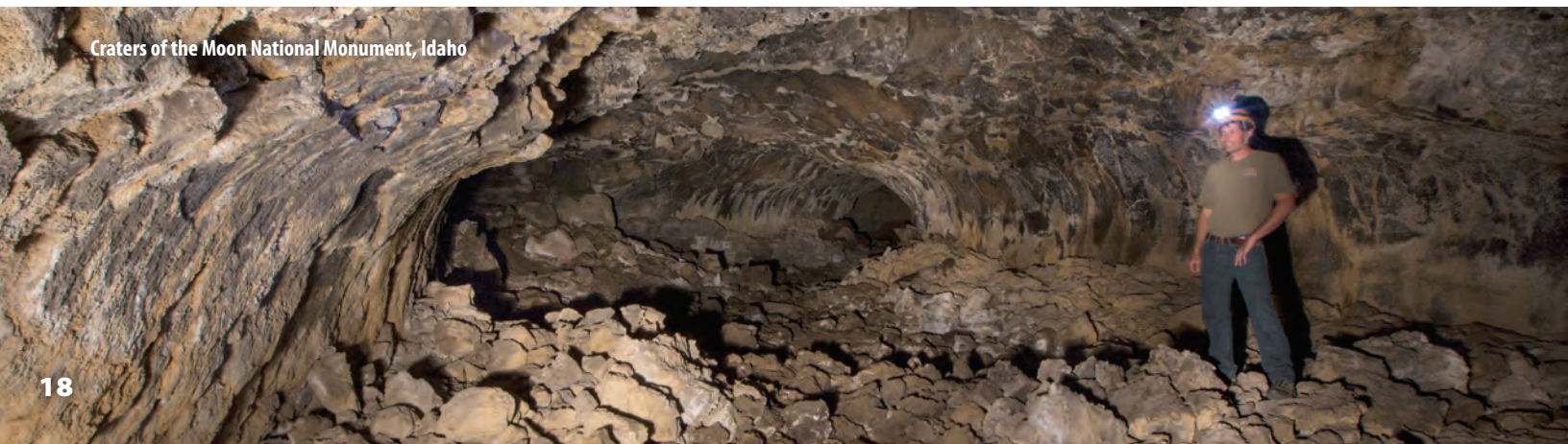
Craters of the Moon National Monument, Idaho